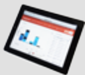
PFREUNDT Web Portal